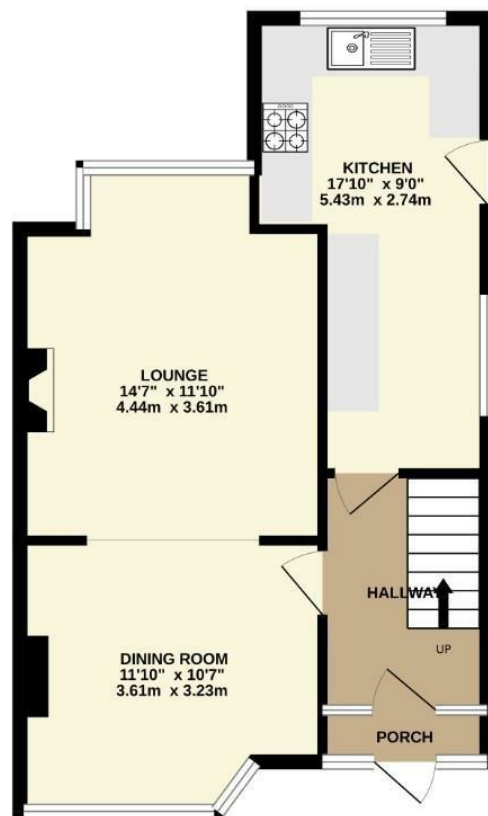
GROUND FLOOR 483 sq.ft. (44.9 sq.m.) approx.